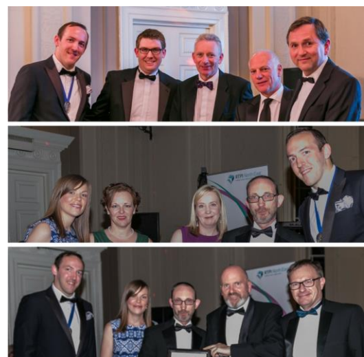
Winners of the 2016 Planning Excellence Awards; Wynyard Gardens and Visitor Centre, Stem Centre and The Curve.