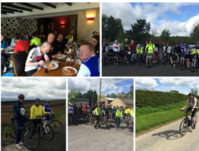
Cycle Challenge 2016; New challenging route which took in the countryside of County Durham.