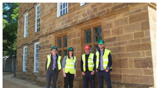
Young Planners visit to Delapre Abbey in Northamptonshire.