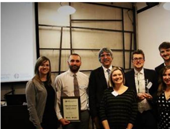
Young Planners Group with the Chairman's Award.